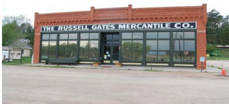
Elbert’s Community Center Today